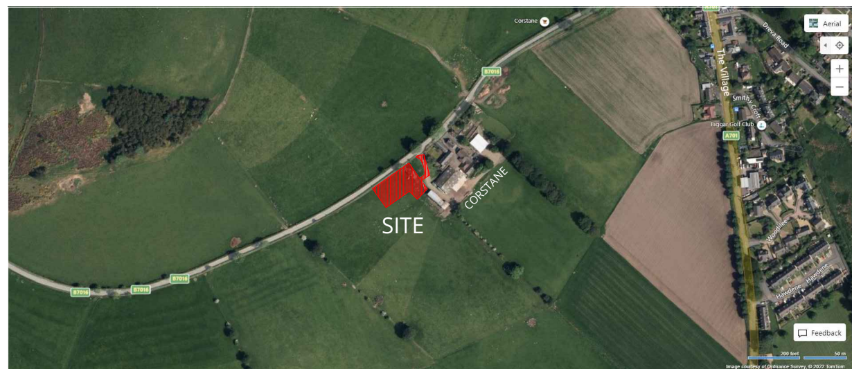
Bing Maps Aerial View NTS